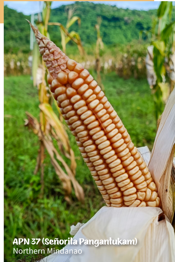
APN 37 (Señorita Pangantukam) Northern Mindanao