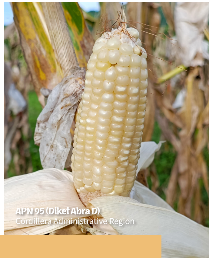
APN 95 (Diket Abra D) Cordillera Administrative Region