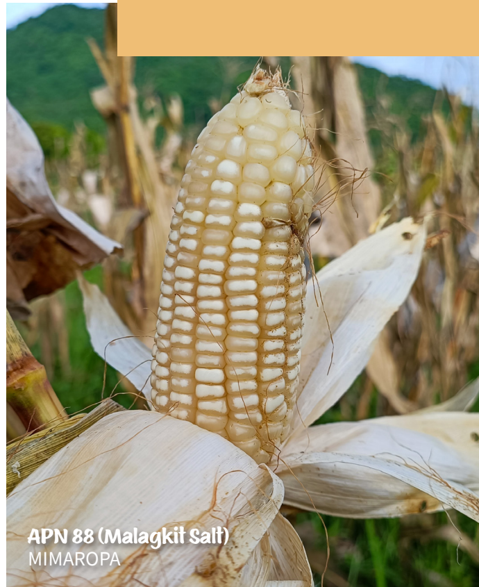
APN 88 (Malagkit Salt) MIMAROPA