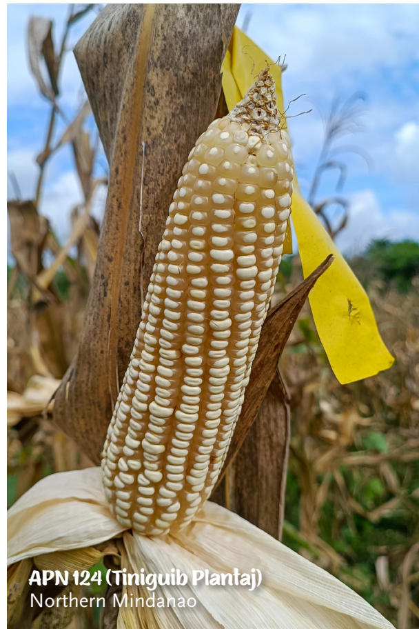
APN 124 (Tiniguib Plantaj) Northern Mindanao