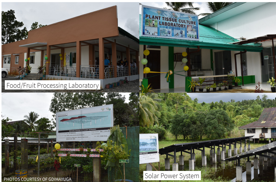
Food/Fruit Processing Laboratory